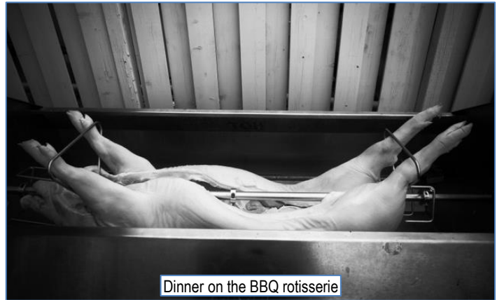
Dinner on the BBQ rotisserie