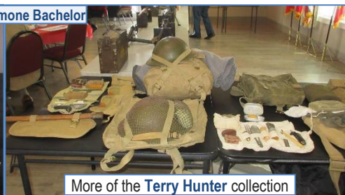
More of the Terry Hunter collection