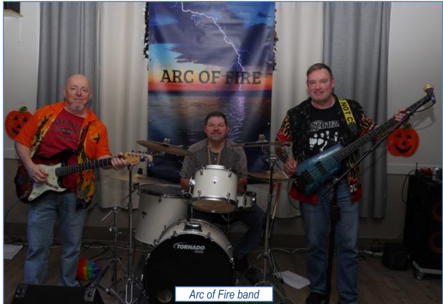
Arc of Fire band