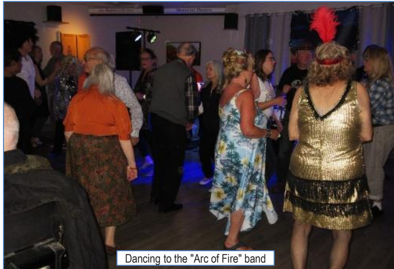
Dancing to the "Arc of Fire" band