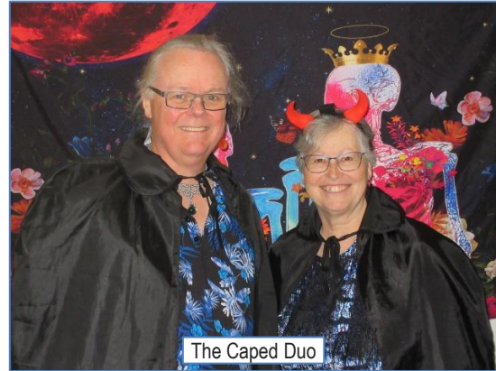
The Caped Duo