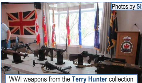
WWI weapons from the Terry Hunter collection