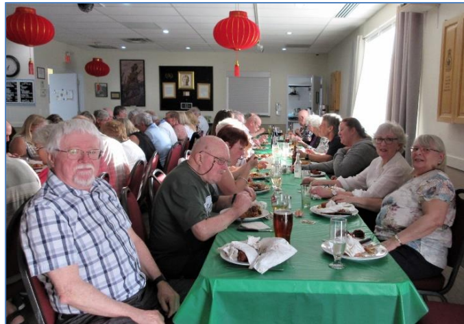
Attendees enjoying their meal