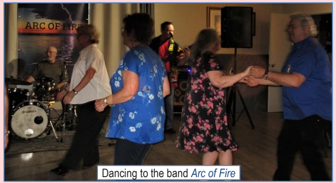
Dancing to the band Arc of Fire