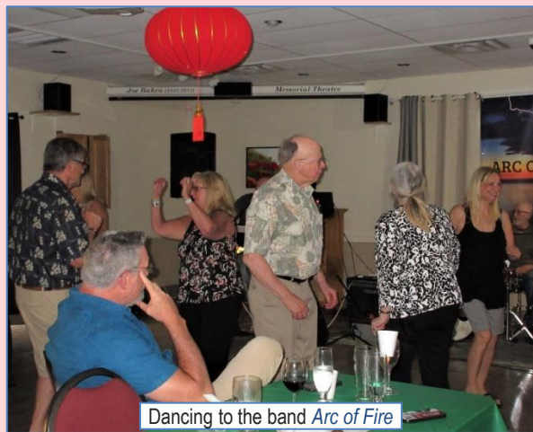
Dancing to the band Arc of Fire