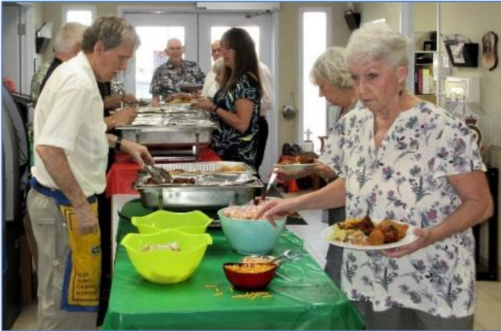
The buffet line