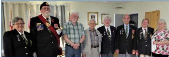
Photo 2 15+ yrs of service Lifetime Members