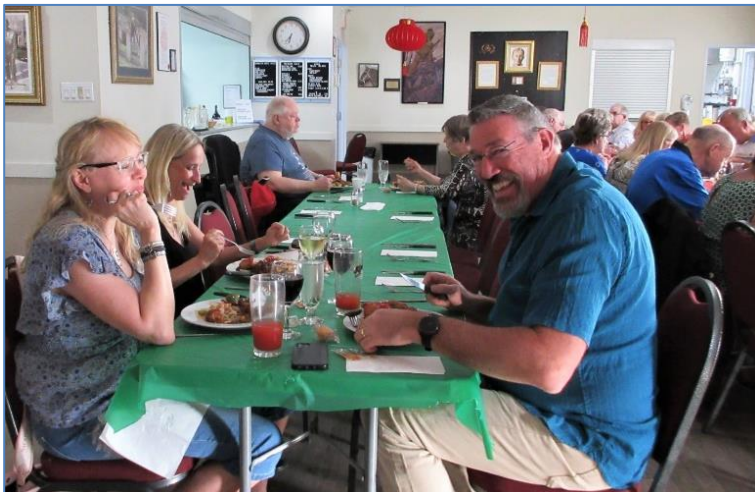
Attendees enjoying their meal