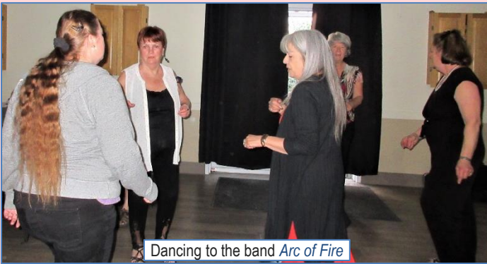
Dancing to the band Arc of Fire