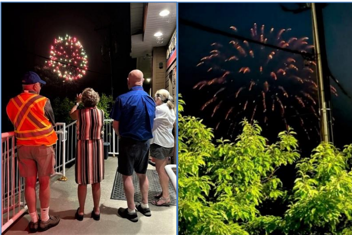
Viewing the fireworks from the front of the Legion.