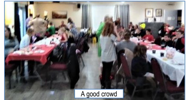
A good crowd