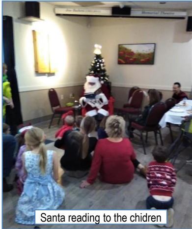
Santa reading to the children